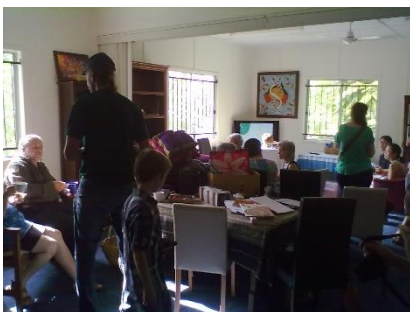
Benarrawa Community Development Association

It's time for someone who can use words to inspire and motivate trading to take over - I will support them according to their skills.