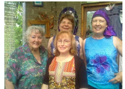
Marg's room LETS built