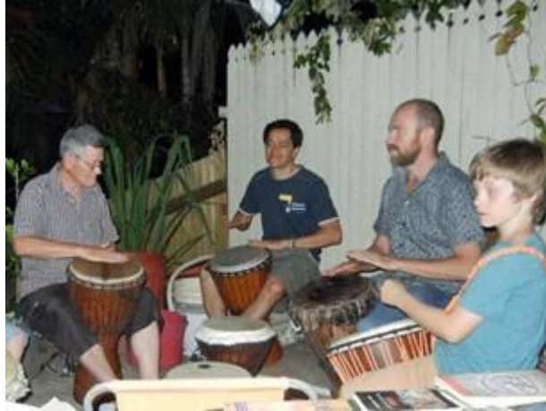
Xmas Party 2013

We have had many wonderful Trading Days here. Address etc in the next newsletter.