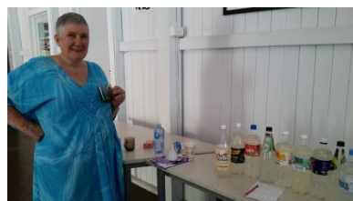
Anne's Ginger Beer