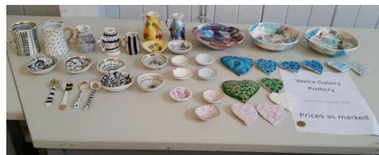
Liz's pottery from her NZ gallery

Unique practical art reusing toilet paper rolls!