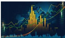
Trading Figures July - Nov 2019

July 75 trades generated 566432.38 units Aug 55 trades generated 569233.56 units Sept 82 trades generated 573660.51 units Oct 82 trades generated 577637.51 units Nov 55 trades generated 580059.31 units.