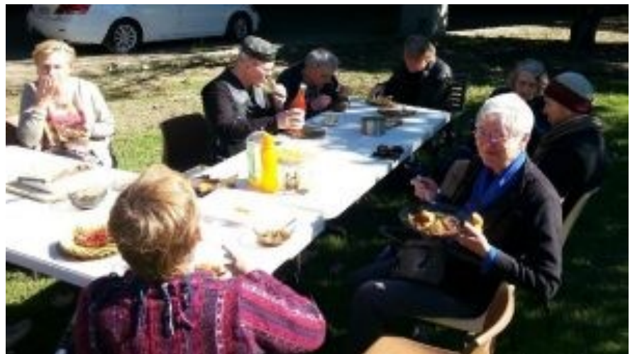
Lunch on the grass at the Peace Hall, Albion