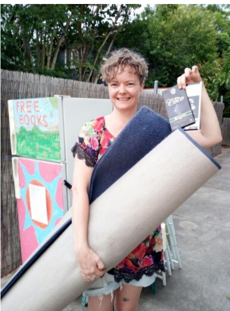
Storm, just back from a successful foray.

landfill, making it is a serious problem when the organic material decomposes and releases methane and other greenhouse gases, contributing to climate change.