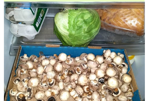
Above and below: Destined for landfill. Rescued and photographed by Storm Furness BLCE0955.